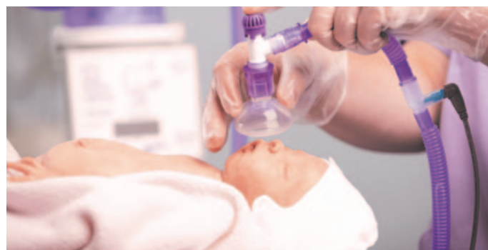
NeoFlow Resuscitation Mask and T-Piece Resuscitation Circuit

concentration. An inline oxygen analyser allows for accurate oxygen monitoring. The NeoFlow range is available from Armstrong Medical.