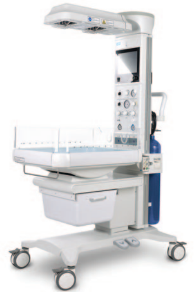
Comen BQ80 Infant Radiant Warmer

Other features include: a far infrared ceramic heating tube to maintain normal skin temperature; a soft, easy to clean heat-conducting silicone gel mattress; a built-in T-piece resuscitator; a 360° visible alarm; a patented tilt angle display function; built-in X-ray film box; electric bed lifting; an integrated electronic scale and a damping door, which reduces noise for the neonate. Central Medical Supplies is now taking bookings from hospitals for a free trial of the Comen BQ80.