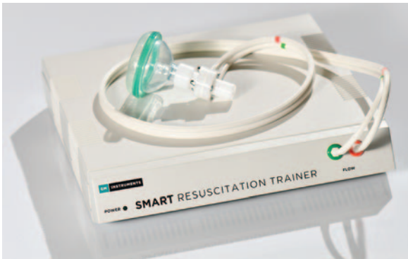
SMART Resuscitation Mask Leak Trainer

Some newborn babies may struggle to breathe at birth, especially those born preterm or with a medical condition. They may require prompt stabilisation or resuscitation – delay can exacerbate hypoxia, increase the need for assisted ventilation and contribute to neonatal morbidity and mortality. In this issue of Infant , we look at the wide variety of equipment used in newborn resuscitation.